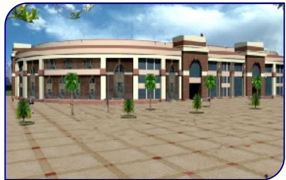
Major Dhyan Chand National Stadium